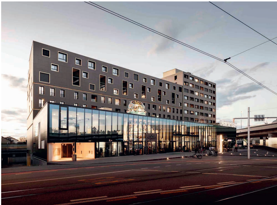
House of Religions, Bern, Switzerland. Architect: Bauart Architects and Planners Ltd., Bern, Switzerland.

Texial not only blends in perfectly with its surroundings, but it is also timelessly convincing.